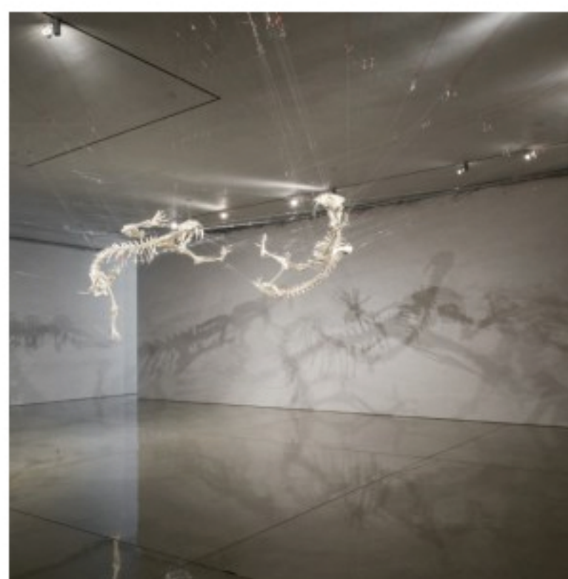
Semi Feral by E.V. Day.

E.V. Day is best known for her explosive sculptures hung in suspended animation, the effect created using monofilament fishing line. For "Semi-Feral" she harnesses a violent brawl in midair between the striking silhouettes of two female saber-toothed tigers. Often employing humor in her work, this single, large-scale piece is part gender commentary, part physics experiment, a floating sideshow act performing without a net. Another branch of the jointly presented show opens October 18 at the James Salomon Gallery. Through October 25